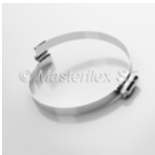
Clip-Grip hose clamp, screwable