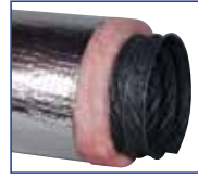
Type 1M Duct Rated