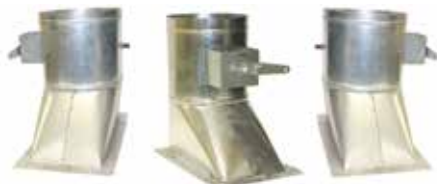
Y Axis Left